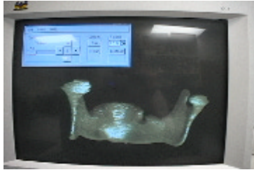
Demonstrate a remote, collaborative application within the ARC system