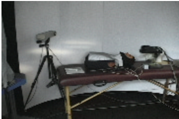
Introduction: The ARC Display system is summarized for the participants