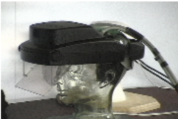
The HMPD operation is described to the participant