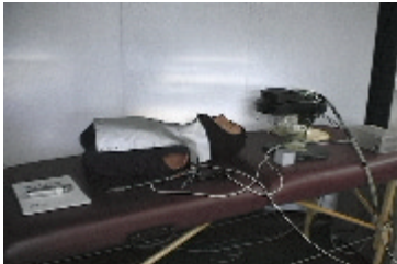
Details about the ARC wall are given