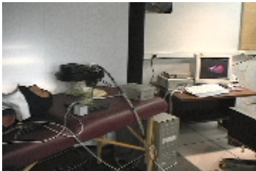
The computer specifications are detailed