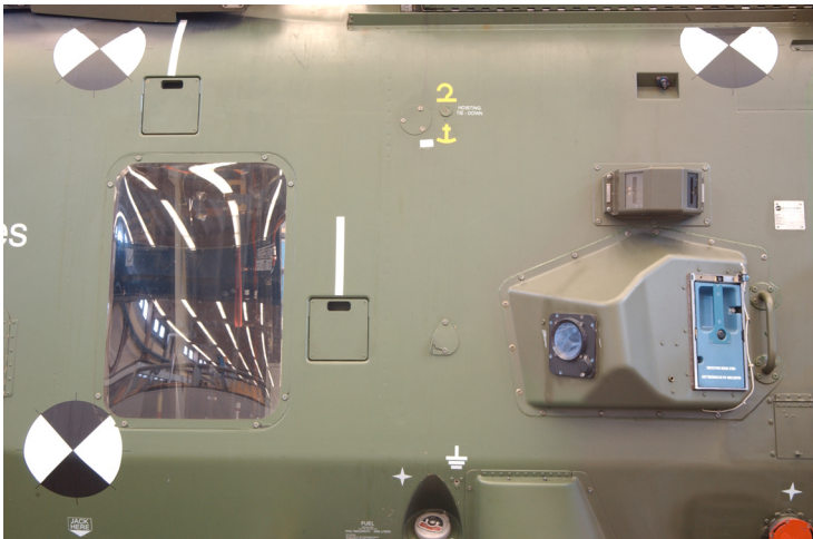
Fig. 1 View onto the Surface of the NATO Helicopter NH 90

The assistance is such that in case of damages to the surface of the NATO helicopter NH90, which is made of carbon reinforced fibre (CFK), information is provided, which specify, for example, the repair scheme applicable at the location of the damage.